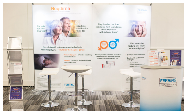
Table top 2m x 1m (£750 plus VAT)