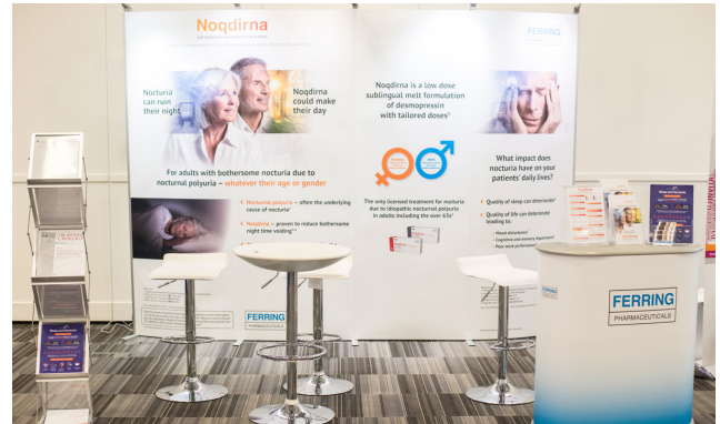
Table top 2m x 1m (£2,000 plus VAT)